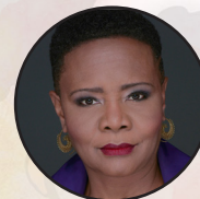
Tonya Pinkins tm*